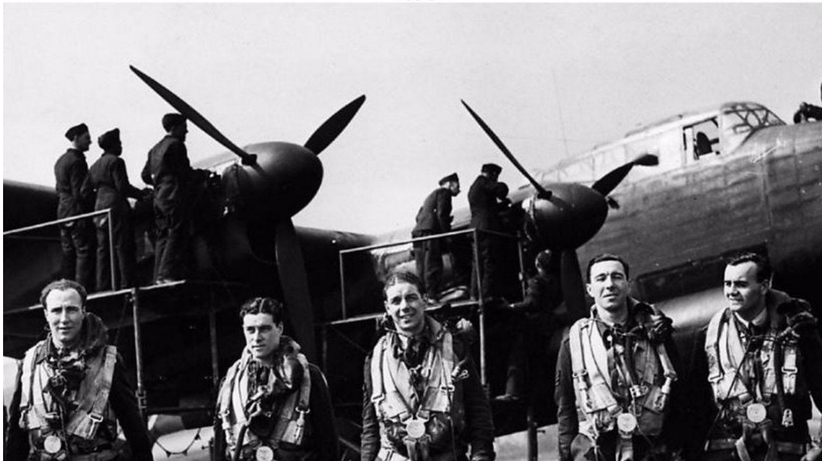
Lancaster crew.